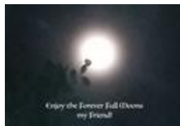
Enjoy the Forever Full Moon my Friend!

“ 38 files added to the album IZAMAL VISIT JAN / FEB 2018