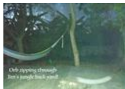
Oh zipping through Jim's jungle back yard!