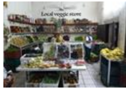
Local veggie store