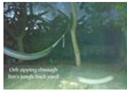
Oh zipping through Jim's jungle back yard!