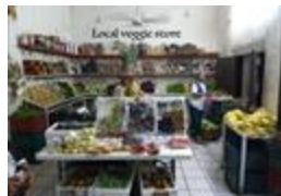
Local veggie store